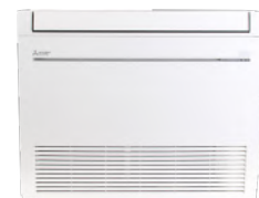
9k BTU KJ High Efficiency Floor Mounted Heat Pump (MFZKJ09NA-U1)