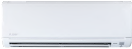
9k BTU HM Single Zone Wall Mounted Heat Pump (MSZHM09NA-U1)