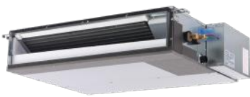
9k BTU SEZ Single Zone Horizontal Ducted Heat Pump (SEZKD09NA4R1)