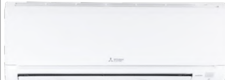
9k BTU GL Single Zone Wall Mounted Heat Pump (MSZGL09NA-U1)