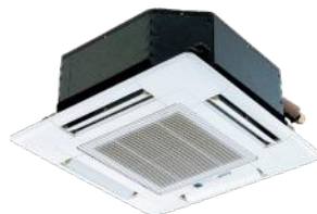
9k BTU SLZ Single Zone Ceiling Recessed Cassette Heat Pump (SLZKA09NAR1)