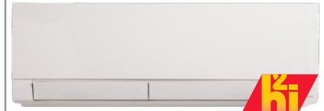
9k BTU FH Hyper Heat High Efficiency Heat Pump (MSZFS09NA)